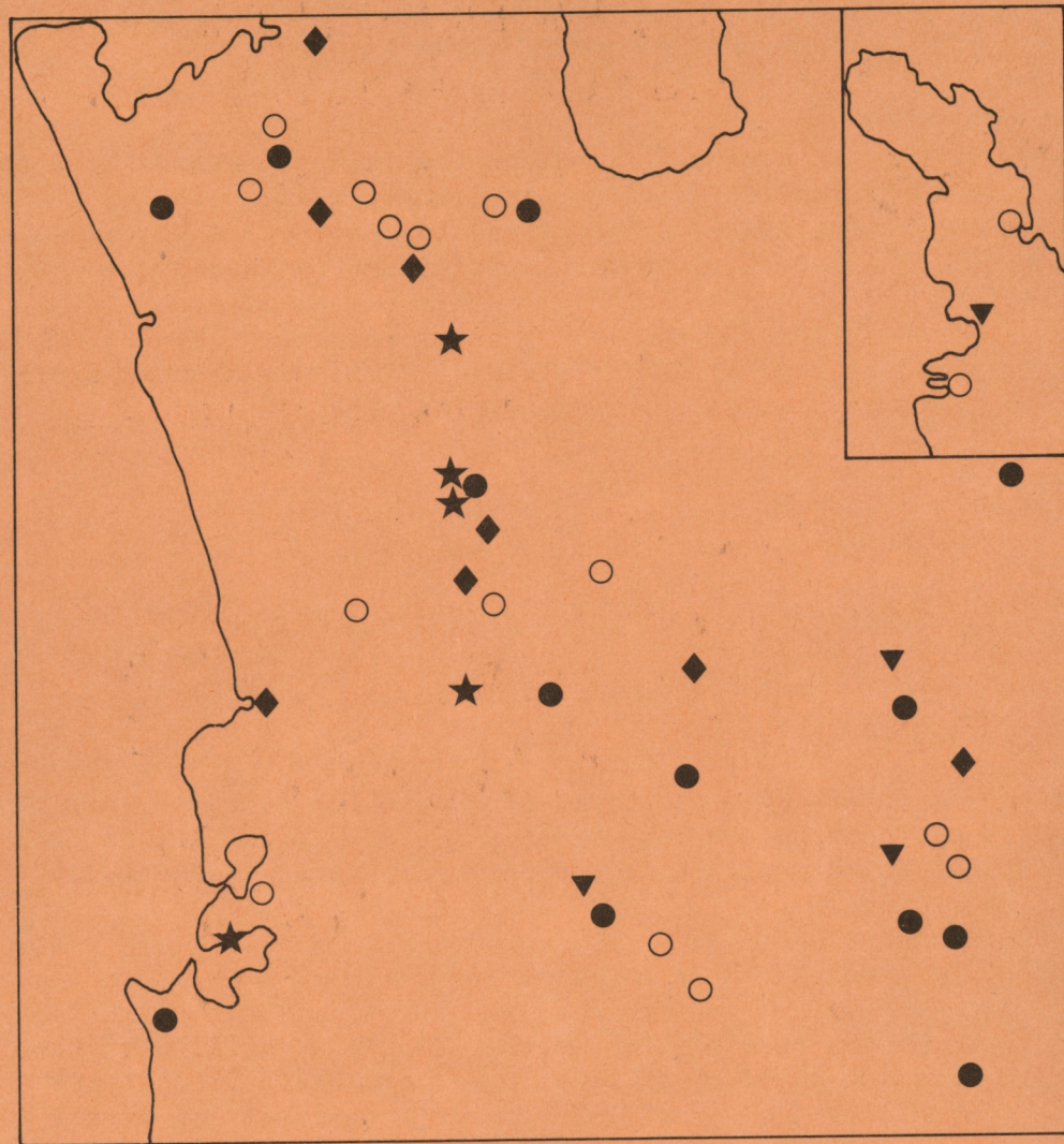
Map showing Towns and Localities of the Waikato Region of the North Island visited during the Census of Language use

Percentage of Fluent Speakers of Maori Among Persons Aged 25 and over in Households visited